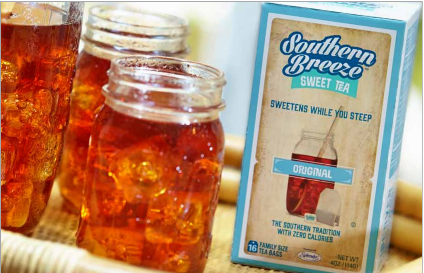
Top: Southern Breeze Sweet Tea Packaging | Bottom Left: Fujifilm Z70 Campaign, Out-of-Home | Bottom Right: Marantz Campaign Website