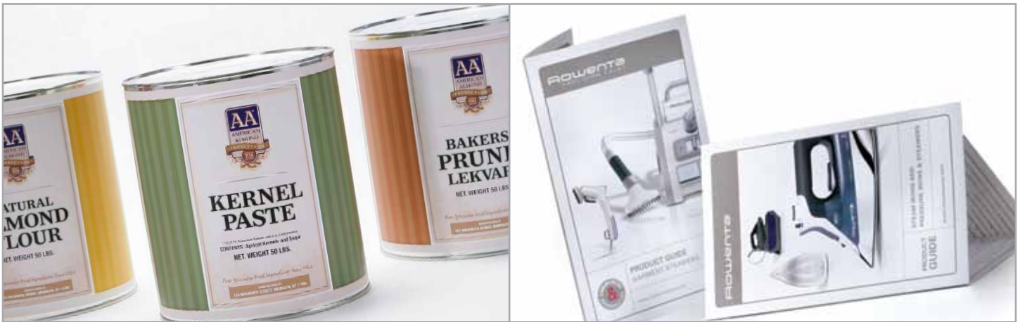
Top Left: American Almond Product Packaging | Top Right: Rowenta Consumer Product Literature | Center Left: IJO Conference Brochure