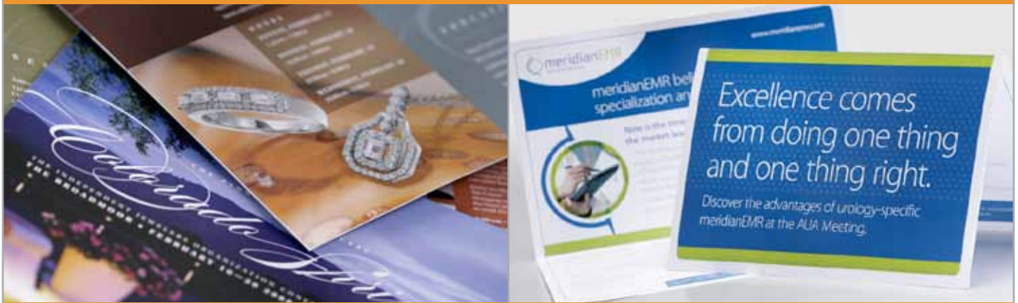
Center Right: meridianEMR Direct Mail | Bottom Left: Fujifilm "REAL 3D" Out-of-Home | Bottom Right: Seton Hall Law Student Recruitment