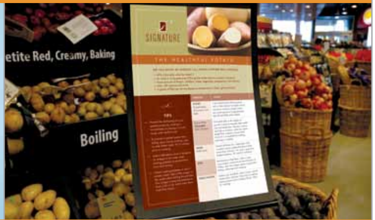
Center Right: A&P Shopper Marketing | Bottom Left: Fujifilm B2B Campaign, Direct Mail | Bottom Right: Fujifilm Brand Website