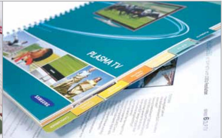
Top Left: Teekanne Product Brochure | Top Right: Samsung Consumer Product Guide | Center Left: Natural Markets Food Group Consumer Promotion