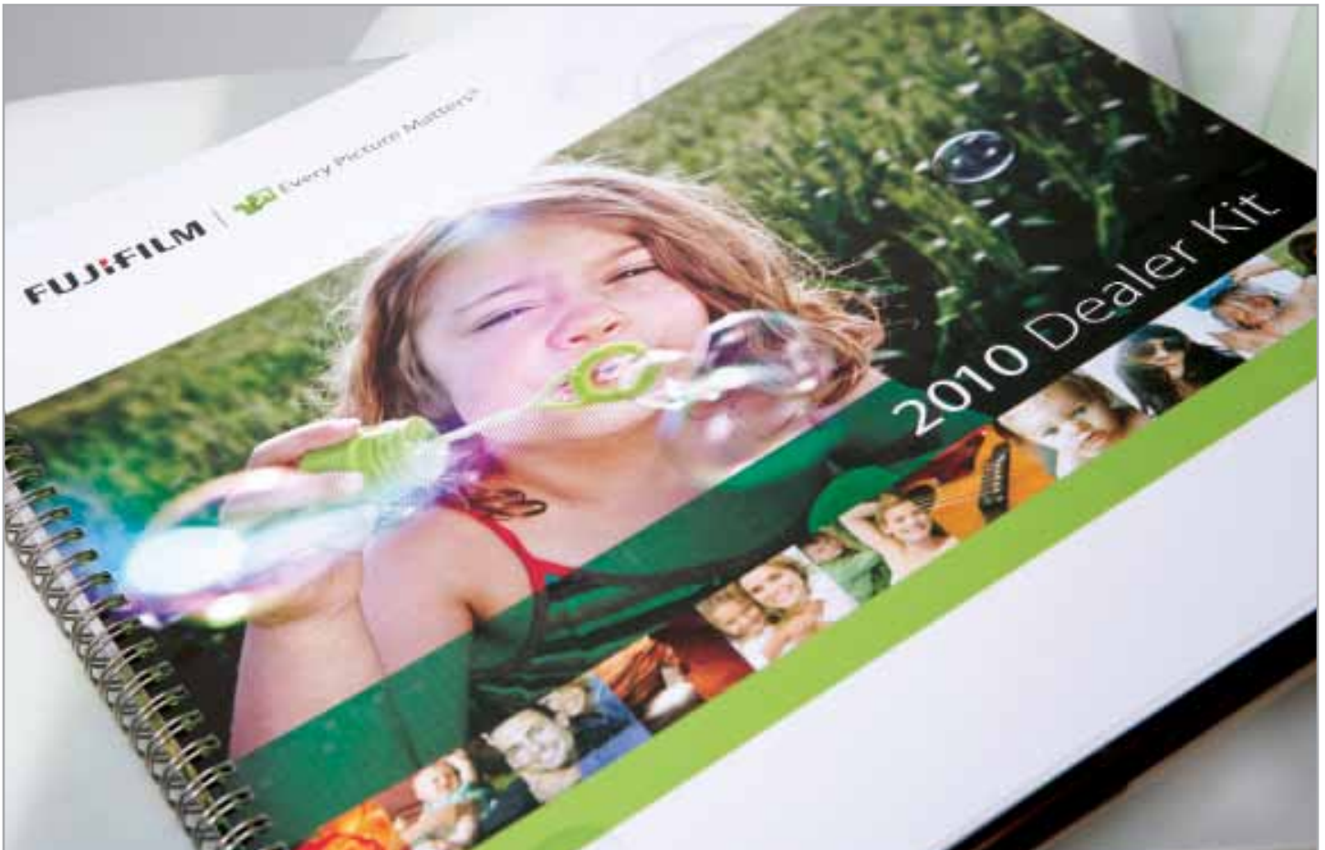
Top: Fujifilm 2010 Dealer Kit | Bottom Left: A&P America's Choice Campaign | Bottom Right: LifebankUSA Patient Marketing